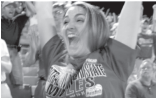
Whether intercollegiate or intramural sports, there's plenty for fans to cheer about at UCM. Admission to regular season sports events is free with student ID.

Fraternities and sororities are a special type of student organization that many students choose to join while at Central Missouri. Students join fraternities and sororities through a process called recruitment which typically occurs at the beginning of each semester. Greek Life offers students the opportunity to develop leadership and organizational skills, participate in community service, and make life-long friends. Friendship, fun, scholarship, community service, and school spirit – Greek Life has it all! For more information, visit the Office of Greek Life located in Elliott Union 217 or call 660-543-4007.