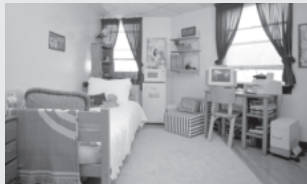
The price of a residence hall room includes local phone service, cable service, Internet access, and utilities. A room comes furnished with two twin beds, one dresser, two desks, two chairs, and a trash can.

Reasons other than those listed may qualify as exemptions based on the determination and at the discretion of the Director of University Housing. The Vice President for Student Affairs shall review appeals of these determinations and the decision upon any such appeal is a final action.