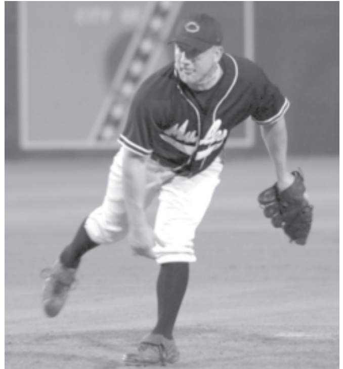
In recent years Mules baseball and Jennies bowling have made it into the national championship playoffs.