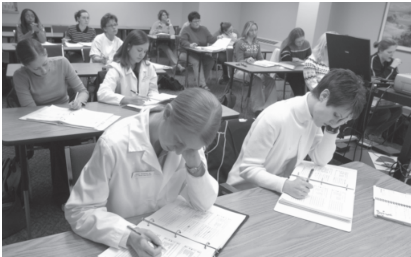
UCM nursing students at North Kansas City Hospital.

Admission to Programs. A student should meet with an academic adviser to determine if the College -BASE for General Education Assessment or the College -BASE for Teachers is a criterion for admission to a program.