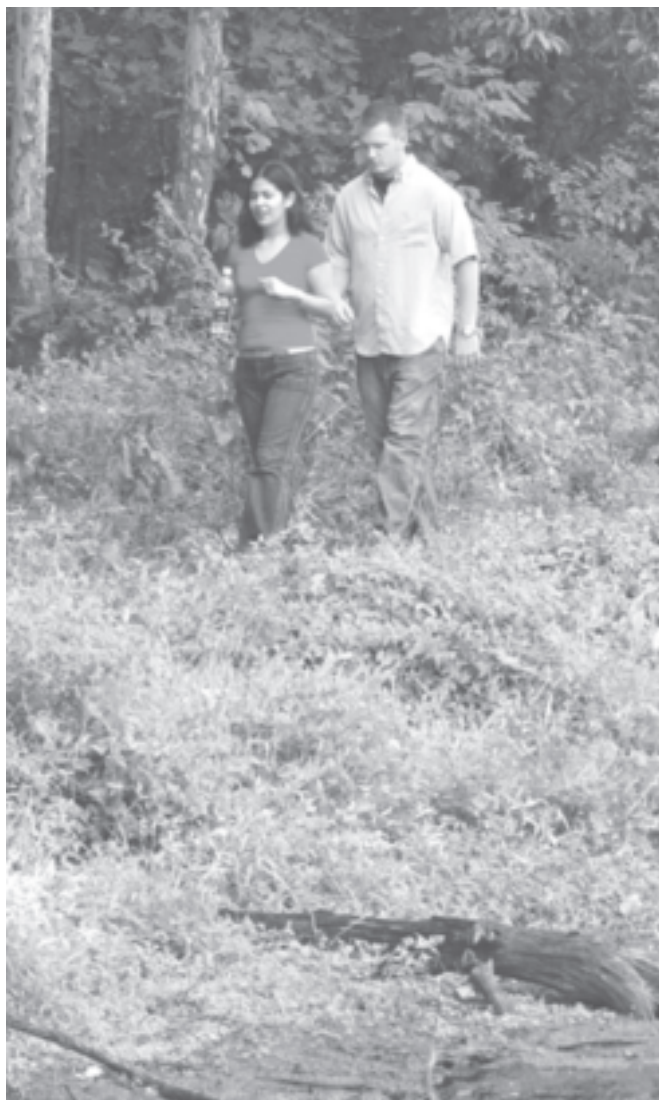
Pertle Springs, a popular recreation area owned by the university, offers hiking trails, a golf course, a lake for boating, and picnic areas.

Five city parks are located within walking distance of campus. Knob Noster State Park, 10 miles east of the campus, offers group and family picnic grounds, hiking trails, and a swimming pool.