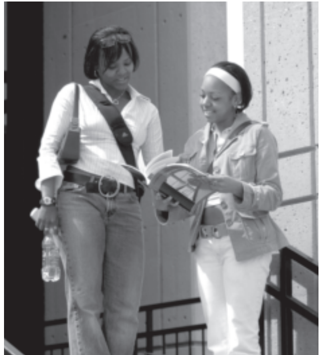
UCM enjoys a student population that is 8 percent multicultural and 4 percent international. Last year, students from 38 states and 51 foreign countries attended Central Missouri.

Persons having inquiries concerning the university's compliance with the regulations implementing any of the above are directed to contact the General Counsel, Administration 208, 660-543-4730, or the Director of Human Resources, Administration 101, 660-543-4255, the University of Central Missouri, Warrensburg, MO 64093. Toll-free numbers for Relay Missouri are 800-735-2966 for TTY, and 800-735-2466 for voice callers.