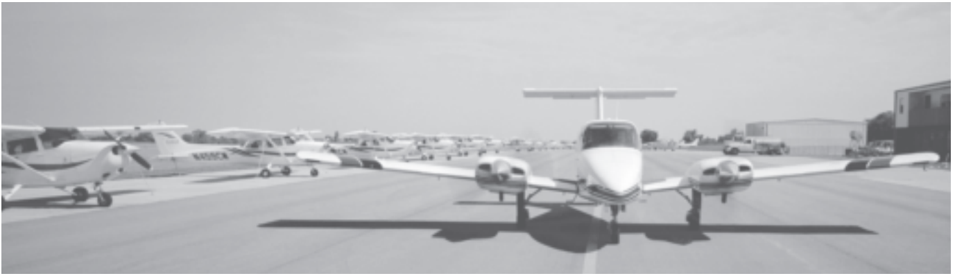
The university's Max B. Swisher Skyhaven Airport is home to a fleet of training aircraft for the aviation program.