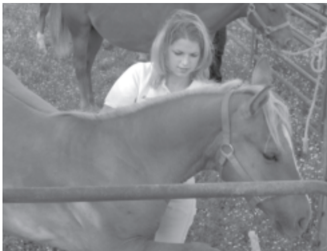
Students groom the horses at the University of Central Missouri Prussing Farm.

Research Involving Human Subjects. In order to comply with federal regulations and to protect the health and safety of human subjects involved in research, all research protocols involving the use of human subjects must be in compliance with Academic Procedures and Policies #9: Procedures for Human Subjects Review . All projects involving human subjects in research must be approved in advance by The Human Subjects Review Committee. Forms are available at www.ucmo.edu/osp .