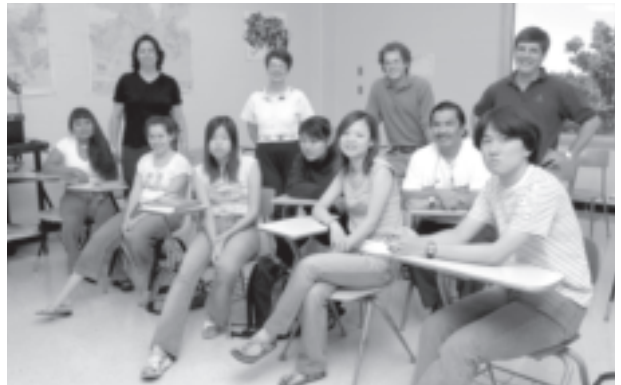
Through Intensive English Program classes conducted throughout the year, including the summers, students learn not only English, but the customs and culture of the United States.

During the orientation session, any international student whose native language is not English will undergo further evaluation for oral and written proficiency and, depending upon evaluation results, may be required to enroll in special classes designed to improve communication skills. The departmental initiated oral and