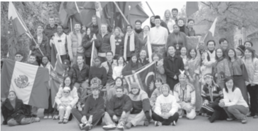
The International Student Organization traditionally sponsors a very colorful entry in the Homecoming parade.

NOTE: An international student normally does not qualify for federal or state financial assistance unless, the student has been designated an eligible non-citizen or a permanent resident by the U.S. Citizenship and Immigration Services (USCIS) of the Department of Homeland Security (DHS). Documentation verifying the student's citizenship status may be required by the UCM Office of Student Financial Services to determine the student's eligibility for financial aid.